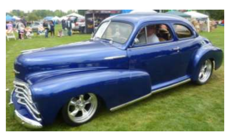
Best in Show Finalist 1947 Chevy Coupe